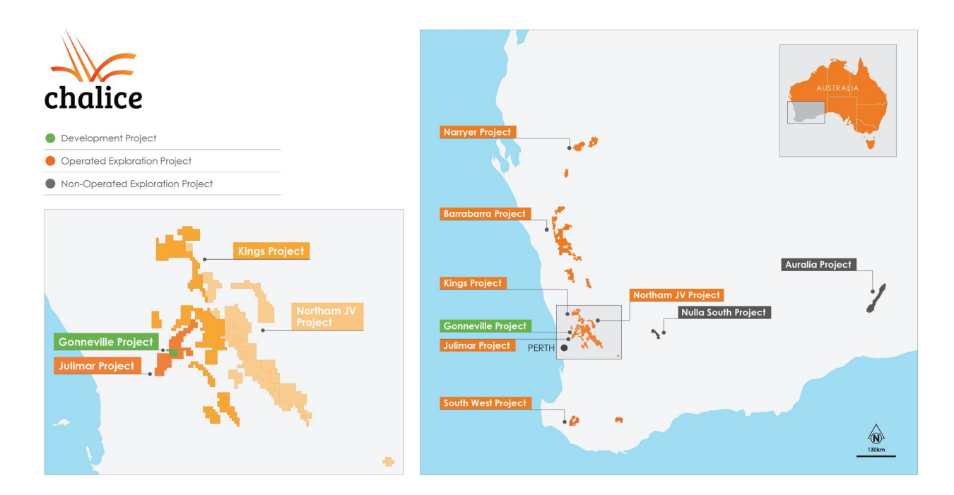
Figure 2. Chalice portfolio map.