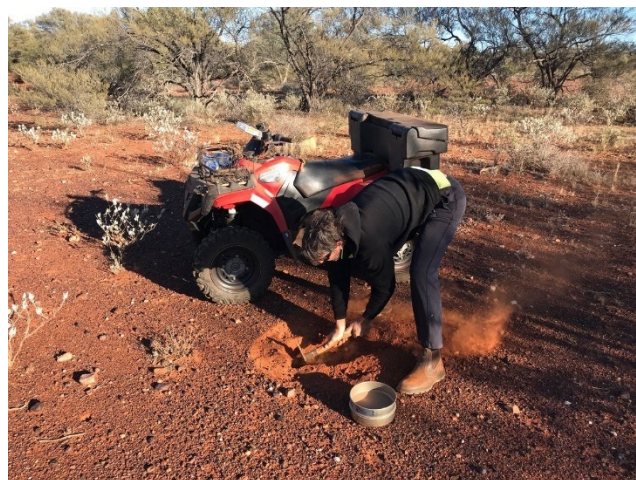
Demonstration of soil sampling – an example of low-impact activities proposed within the Julimar State Forest.

The primary purpose of these activities is to effectively screen large areas quickly with minimal impact.