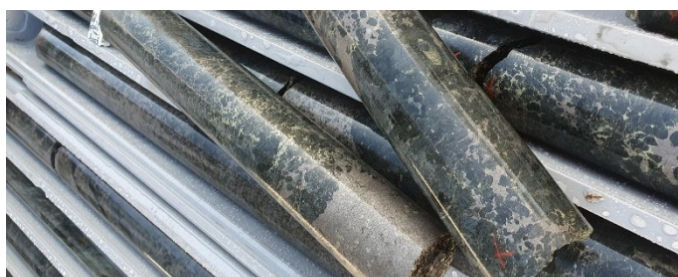
Drill core specimen from the Julimar Project.

There are a number of follow-on stages to complete before mining may commence at Julimar, and Chalice anticipates this could take several years.