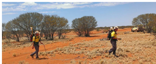
Example of electromagnetic geophysics – another low-impact activity proposed within the Julimar State Forest.