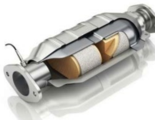
Example of a catalytic converter in a passenger vehicle, which requires a significant amount of palladium and/or platinum to manufacture.

The PGEs, nickel, copper and cobalt metals also have a key role to play in electric, hybrid and hydrogen fuel cell vehicles. As such the Julimar discovery is considered globally significant and could become a major green energy metal mine of the future.