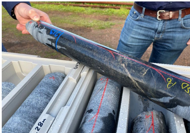
Example of a drill core sample at the Julimar Project, from the main Gonville discovery located on private farmland.