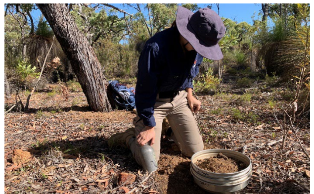
Chalice staff conducting low-impact soil sampling in the JSF.

These low-impact activities will be completed largely on foot, with vehicles used only along existing tracks. The primary purpose of these activities is to effectively screen large areas for minerals with minimal impact.