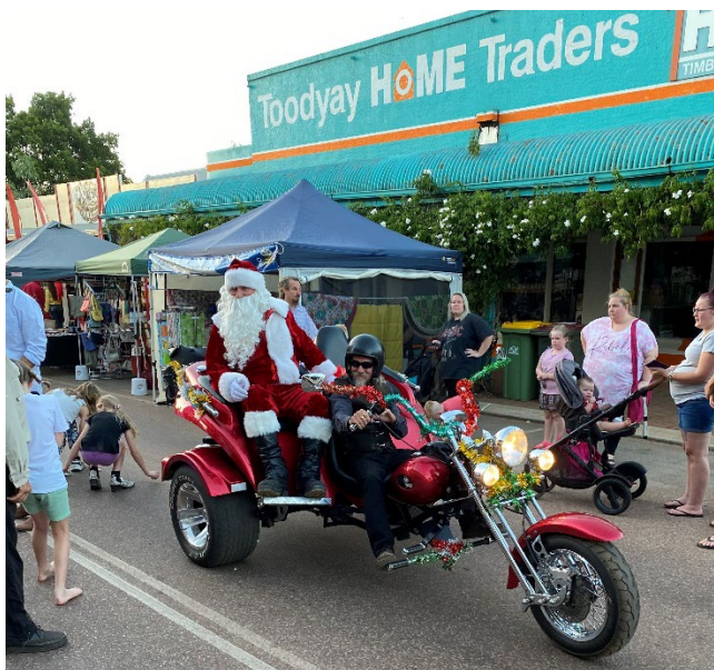
Santa arrived in style, much to the delight of guests at the 2020 Toodyay Christmas Street Party.