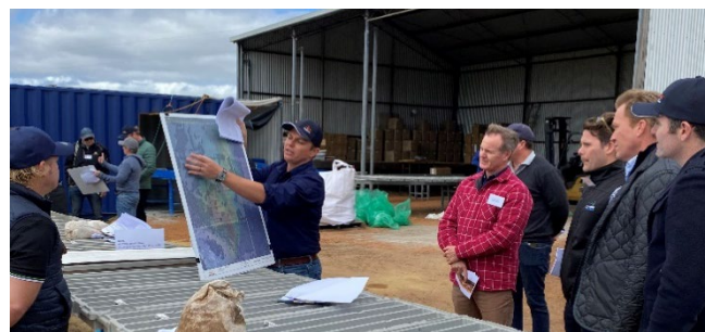
Onsite with visitors at the Julimar Project.

The recent events are a timely reminder of the increased fire risk during the summer months. Chalice has robust fire prevention and response procedures in place, adheres to all fire ban and movement ban restrictions and is committed to ongoing team training and community support.