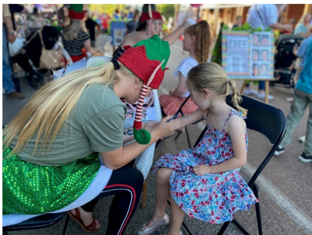
Free face painting was part of the festivities at the 2020 Toodyay Christmas Street Party.

A number of the Chalice team and their families joined in the Street Party!