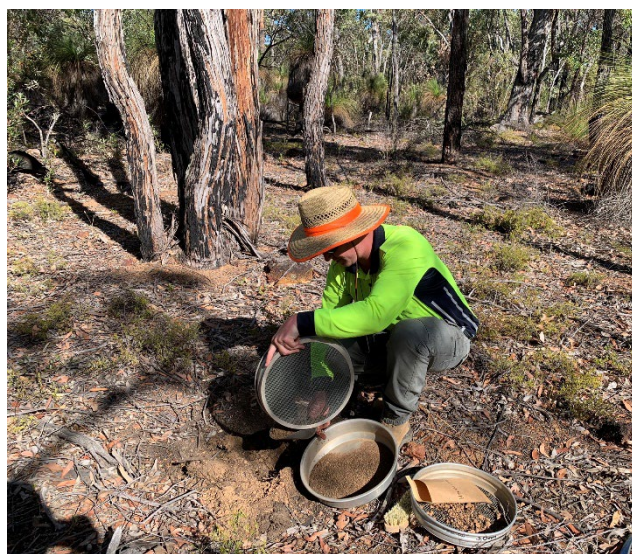
Chalice staff conducting surface soil sampling in the Julimar State Forest in February 2021 – a low-impact activity. The approved exploration activities within the JSF will have negligible impact on vegetation and fauna, as no clearing or ground disturbance will take place.