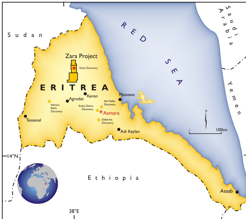
Figure 1 – Zara Project Location Map